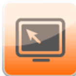
DATA COLLECTION ENGINE