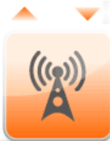
ADVANCED COMMUNICATION NETWORK